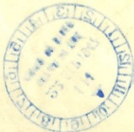
RAMON LIMJOJO 1016 T. Ayala Singalong, Manila